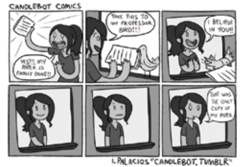
3RD PLACE comic panel/strip: Isabella Palacios, Texan