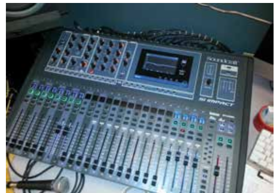
Left: a new lounge layout facilitates discussions in the KVRX studios. Right: new equipment graces the TSTV studios.