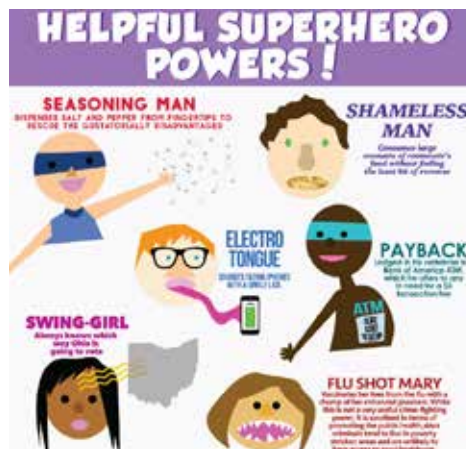
Excerpts from fall issues of the Travesty.