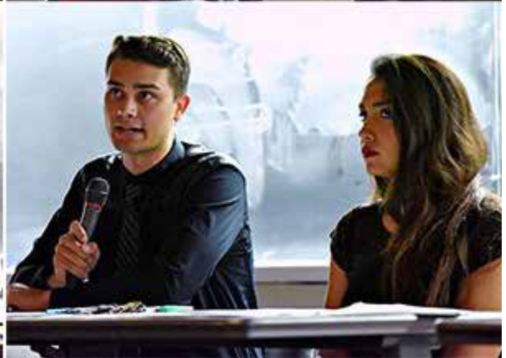
Students discuss issues during the weekly Texan Talks