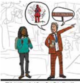
2ND PLACE best editorial cartoon: Travesty