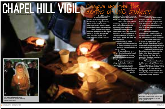
1ST PLACE best yearbook news page/spread: Cactus